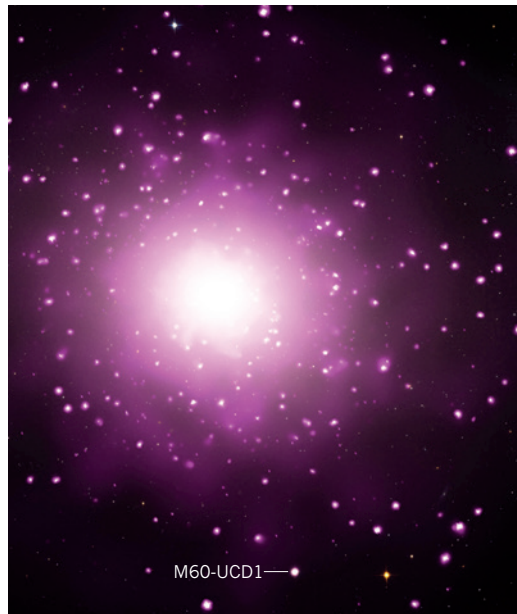
Figure 1 | Dwarfed by its neighbour. This composite image, constructed from data from NASA's Chandra X-ray Observatory and Hubble Space Telescope, depicts the massive elliptical galaxy M60 and the nearby ultra-compact dwarf galaxy M60-UCD1. Seth et al. 2 report that M60-UCD1 contains a supermassive black hole.

Seth and colleagues present the first clear case that an individual ultra-compact dwarf is a stripped-galaxy nucleus, because star clusters do not host supermassive black holes.